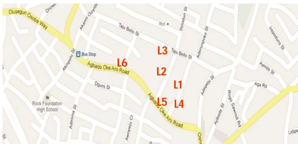
Fig. 1 Map of Taju-Bello showing the sampling location

Population growth and unplanned urbanization have brought dumpsites close to the people. Little or no attention is paid to waste disposal in most semi-urban communities like Taju-Bello by individuals and government agencies due to lack of information on the possibilities of life-threatening emissions and contaminations from dumpsites. The pollution and odorous assessments of VOCs from dumpsites on air and water quality have not been well reported in Nigeria except for effects of heavy metals from dumpsite on water quality. Therefore, this study was designed to determine levels of hazardous and odorous compounds in air and leachates in and around Taju-Bello dumpsite.